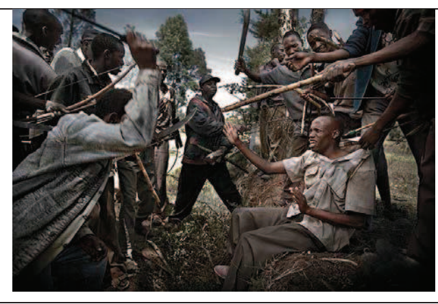
The Kalenji warriors have caught an "enemy lookout" in Chepilat. The aggressive fighters want to kill him immediately.