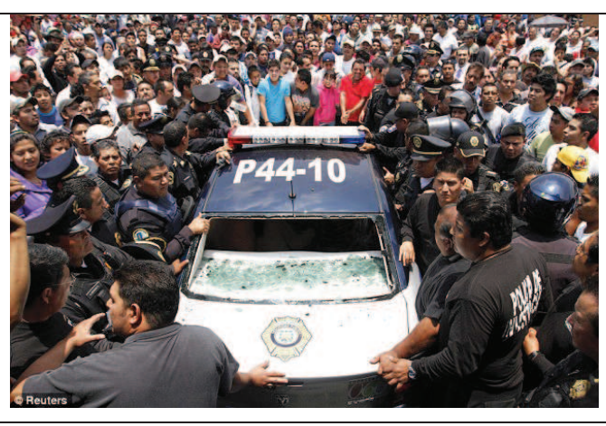
Lynch mob: Furious residents surround a police car carrying four suspected thieves in the crime-ridden village of San Lorenzo Acopilco on the outskirts of Mexico City.