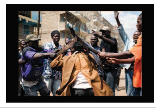
An angry mob of Luos attack a Kikuyu man in Mathare North slum whom they accuse of a crime.