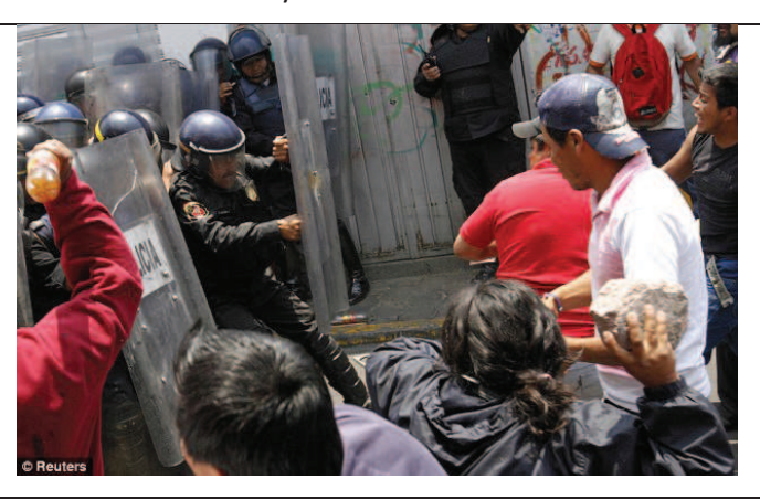
Showdown: Riot police clash with residents as they hurl bricks and stones towards the police car carrying the suspected thieves.