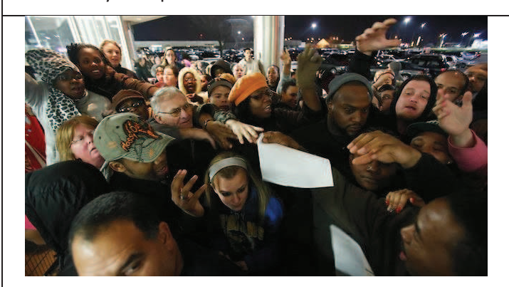
Black Friday stampede